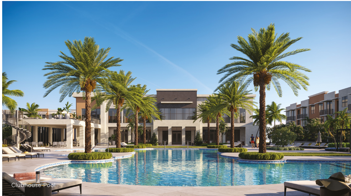
Artist's Conceptual Renderings